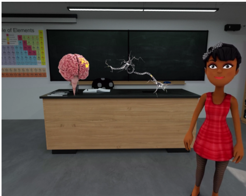
Figure 1. Screen Capture from VR Personality Project – lesson on neuroplasticity.

Youths who become dizzy or experience discomfort during the VR experience will be permitted to take breaks, or stop participating, at any time. Generally, glasses fit within the VR headset and may be worn during the intervention; however, the choice to wear or remove glasses (for participants who wear them) will be made on a person-to-person basis, based on personal preference and comfort. Youths will be reminded of this at the start of the laboratory session and again before starting the VR experience for those randomized to this condition.